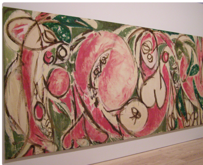
B The Seasons Lee Krasner, 1957