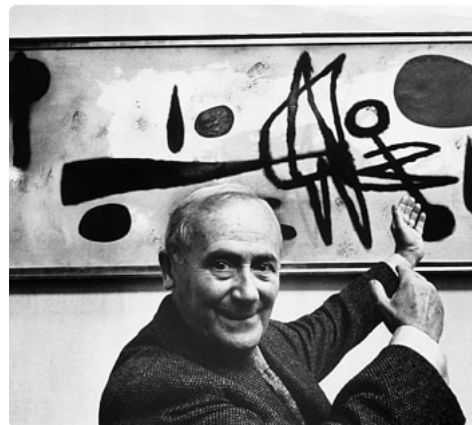
Joan Miró